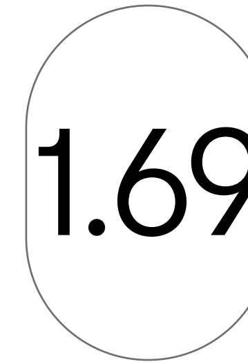
tonnes of asbestos removed